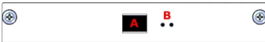
Fig. 2: Front of the TBC1-1SFP Card

Figure 2 shows the front of the TBC1-1SFP card: