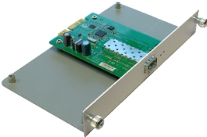
Fig. 1: TBC1-1SFP Card

The TBC1-1SFP card ( Small Form-Factor Pluggable ) provides connectivity to a single Gigabit Ethernet device or to a network, permitting clients to use different SFPs for special requirements such as distance, cost, existing infrastructure or future expansions.