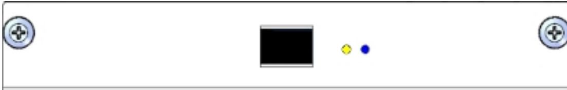
Fig. 3: TBC1-1SFP Card: LEDs

The TBC1-1SFP expansion card has two LEDs: