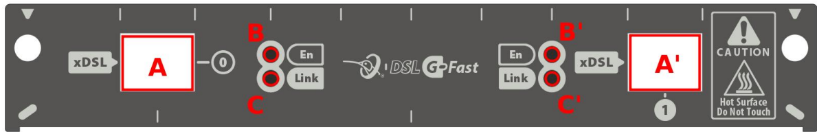
Fig. 3: Front of the double-port TBC1-GFAST card

The front board elements are as follows: