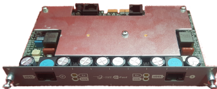
Fig. 1: TBC1-GFAST card

For further information on ADSL, VDSL2 and G.Fast technologies, please see the bintec Dm741-I ADSL-VD-SL2-GFAST manual.