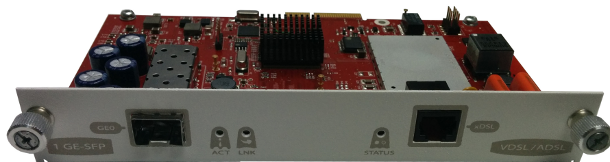
Fig. 1: TBC1-1VDSL1SFP card

For further information on ADSL and VDSL technologies, please see the Teldat- Dm741-I ADSL-VDSL manual.