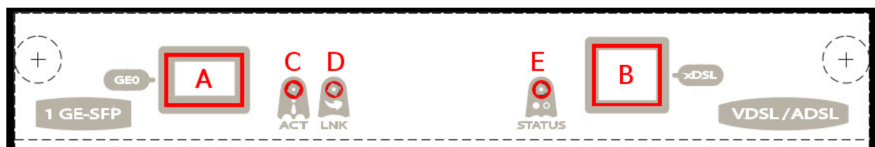
Fig. 2: Front of the TBC1-1VDSL1SFP card

Figure 2 shows the front board of the TBC1-1VDSL1SFP card: