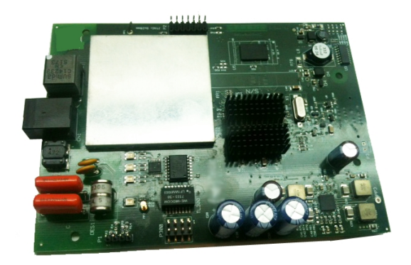
Fig. 1: ATH-1xDSL Card

For further information on ADSL and VDSL technologies, please see manual "Teldat-Dm741-I ADSL-VDSL" .